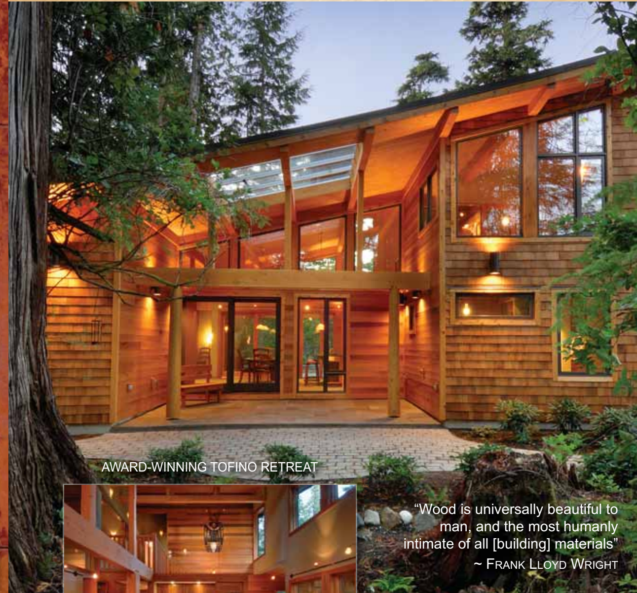
AWARD-WINNING TOFINO RETREAT

WHERE STRENGTH AND DESIGN JOINS NATURAL BEAUTY.